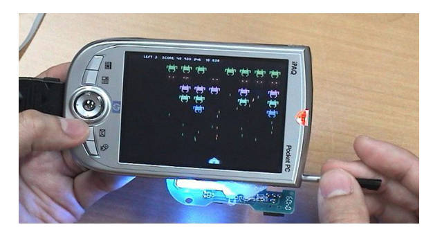
Figure 4: Space Invader: A "moving object" example

Since the basic operation of RodDirect is simple and intuitive, no special instructions are necessary. We do not say that RodDirect can cover all conventional tapping. But we introduced a temporal two-handed interaction as an alternative of one-handed and full-time two-handed ones. RodDirect is robust, and it works everywhere and at free angle of the device. We believe that RodDirect enhances the usability of handheld devices such as PDAs, cellular phones, and smartphones even if the device does not have a touch-sensitive display installed.