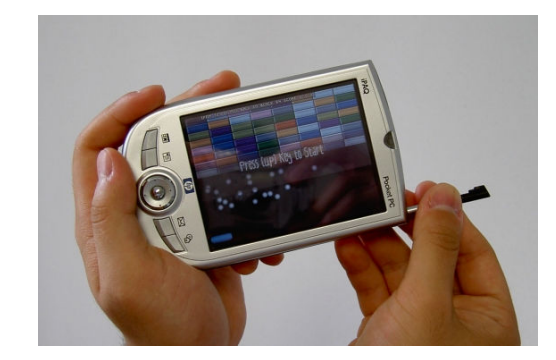
Figure 1: An interaction style of RodDirect; A user rotates and slides the stylus to operate handhelds.

Figure 1 shows an interaction style of RodDirect. Assume that the cross section of the stylus is circular. The user holds the stylus between his/her thumb and forefinger (or the middle finger) and rotates/slides the stylus. RodDirect detects the amount of the rotation/sliding movements continuously. Thus it enables the user to control two parameters simultaneously. This function can be applied for several tasks such as scrolling, pointing, and zooming.