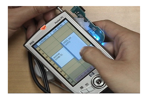
Figure 3: Scheduler: A "scrolling" example with a touch panel operation by thumb.

We have proposed novel and simple interaction technique "RodDirect" for handheld devices using the movements of a stylus inside the stylus holder. We have shown merits and applications of RodDirect.